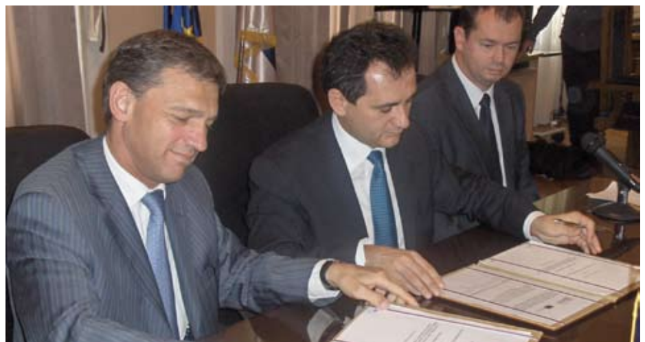
The Head of EU Delegation to Serbia Ambassador Vincent Degert, Serbian Deputy Prime Minister Božidar Djelić and Mayor of Niš Miloš Simonović

The Head of EU Delegation to Serbia Ambassador Vincent Degert and Serbian Deputy Prime Minister for European Integration Božidar Djelić signed a financial agreement between the European Union and the Serbian Government on the National Programme for the Republic of Serbia concerning the first IPA component - assistance in the transition and institution building for 2010 at Niš City Hall.