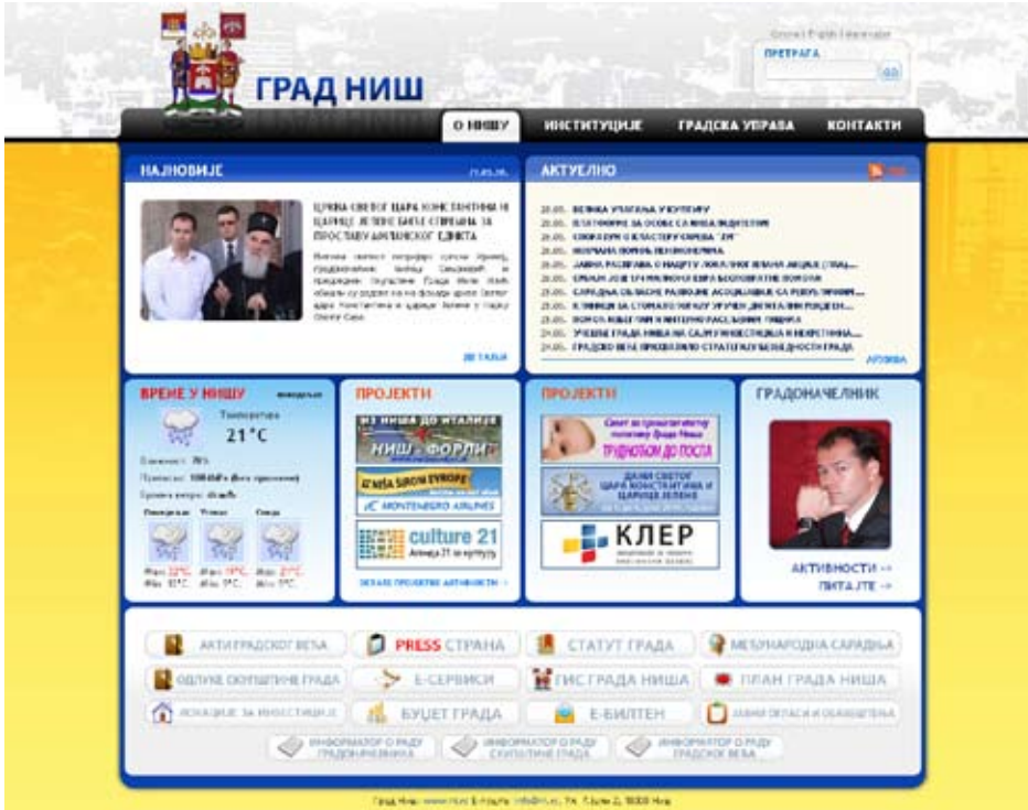
Niš official web site: www.ni.rs

The City of Niš is one of the five cities in Serbia with the best internet presentation in the country.