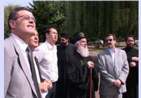
Patriarch Irinej and Niš City officials visiting ongoing works on the Church "Emperor Constantine and Empress Helen"