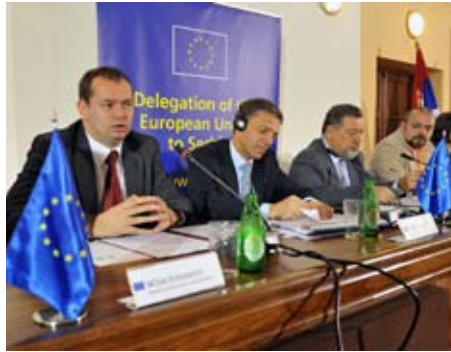
Conference at the University "Serbia in EU - Opportunities and Challenges for Serbian Youth"

Welcoming the present guests Nis City Mayor said the process of EU accession and future membership represented the strategic goal not only of Serbia government but of all Serbia citizens. "Work on European integrations is big and demanding job which require persistence, patience and long-term commitment and the road to EU is long and it requires all encompassing reform of the society. It