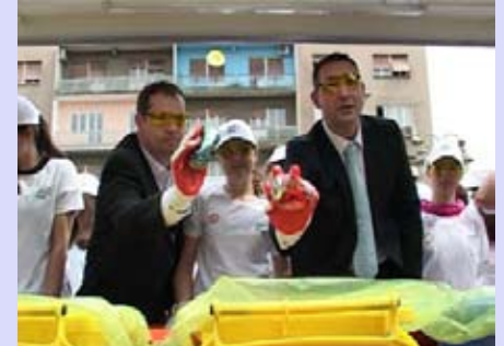
Recycling starts in Niš

The City of Niš will be the first city in Serbia where the package waste will be recycled systematically.