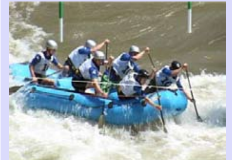
Rafting on the Nišava River

City of Niš was the host of the European Rafting Championship 2010 organised by Serbian Rafting Federation under the patronage of the Niš City.