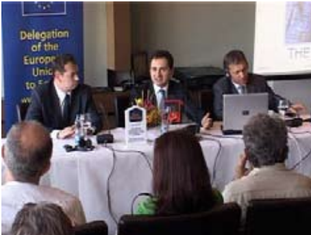
IPA funds presentation

All projects will directly benefit the economic growth of Serbia, European integration process and everyday living of Serbian citizens. Among other things, the funds will be used for programmes of support to local infrastructure (31 mill Euros) and infrastructure development in higher education (25 mill Euros), as well as a support programme for South and Southwest Serbia (13.7 mill Euros).