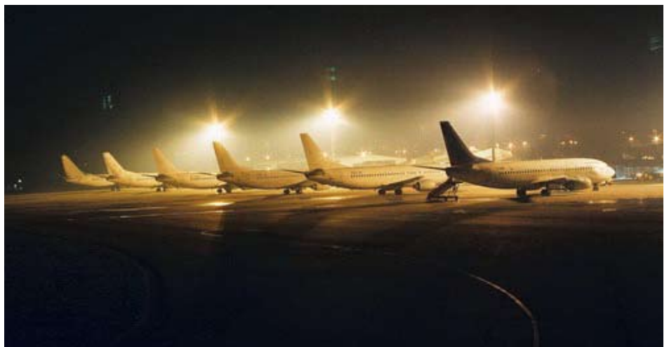
Niš Airport Constantine the Great

New flights from Niš Airport and strategic partnerships with new airline companies prove the intention of the city management to achieve the set objectives for the development of air traffic. The investments into Niš