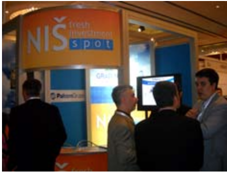
Invest in Serbia Fair

Planning Oliver Dulić. USAID, together with its partners in this initiative - NALED, SIEPA, Privredna Banka Beograd, Telenor, Vip Mobile, and the Serbian Chamber of Commerce – jointly provided prizes worth nearly $200,000 dollars for the winners of the competition.