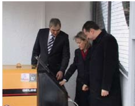
Turning on the generator

the primary health care system whose main objective was to improve the health care system and availability of emergency medical care services.