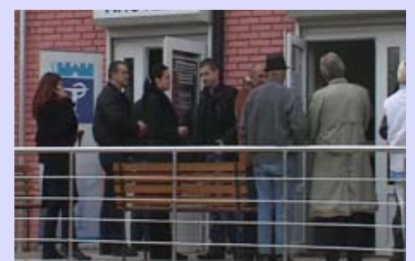
Health Care Station Delejski Vis