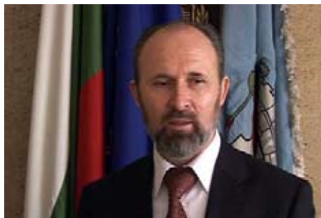
Koce Trajanovski, Mayor of Skopje