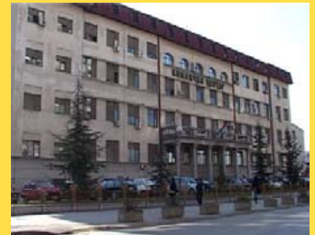
Niš Clinical Center