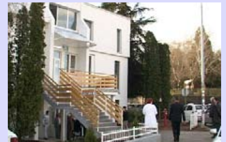
Health Care Station Ledena Stena

These new outpatient stations include the pharmacy and provide the services of the general practitioner and paediatrician as well as the services of the laboratory, infusion center and counselling. The City invested 35 million dinars in the construction works and furnishing of these three new stations.