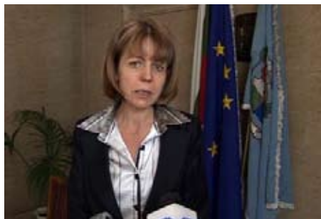
Jordanka Fondakova, Mayor of Sofia

This meeting was the opportunity to define the priorities of the common regional development in the triangle Niš – Sofia – Skopje. These three local self-governments will do everything within their jurisdictions to intensify the cooperation between the business communities primarily. EU – Region Niš – Sofia – Skopje covers 66 municipalities and 2 million people in three countries. The City of Sofia will present this project to the EU member states and it would search for the funds to finance the activities within this project. The establishment