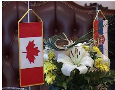
Reception at Niš City Hall