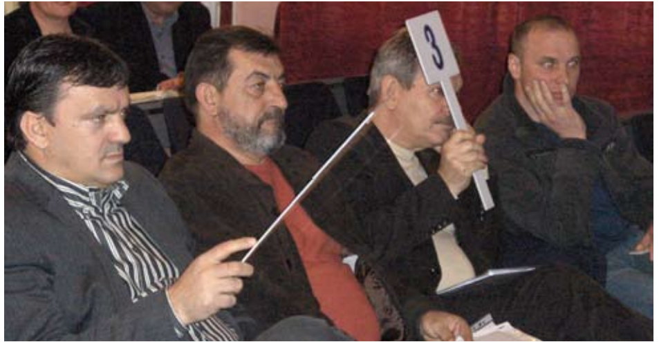
First successful city land auction

The company IMO REAL Ltd won the auction with 34.313.500,00 dinars for the land slot with the total area of 4289 sqm in the settlement