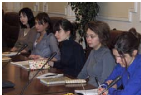
Reception at Niš City Hall

Their visit is the continuation of the cooperation between the City of Niš and the City of Arles on the projects of historic heritage valorization. After reviewing the sites in Niš Fortress, this study group will develop the detailed analyses of the objects inside Niš Fortress with the aim of utilizing their full potentials. Taking into consideration that Niš Fortress is the site categorized as the cultural monument of great importance, making the detailed lists of the archaeological sites characteristics, their current conditions and priorities related to the preservation and rehabilitation is crucial. On the occasion of the reception at Niš City Hall, Councilor