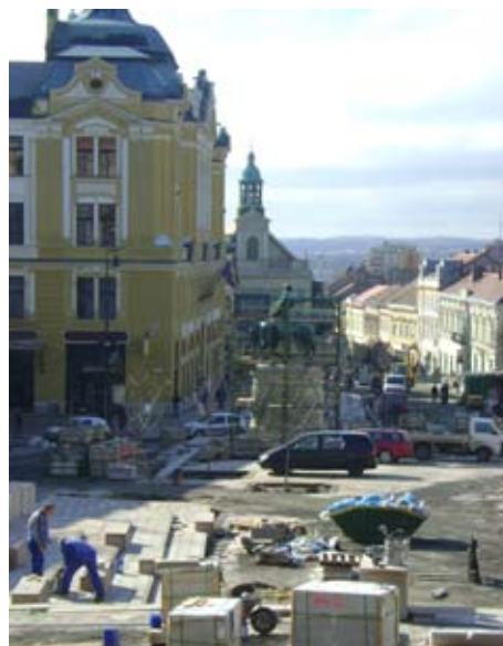
Pecs 2010 European Capital of Culture Project – Revival of Public Spaces

but for the entire South Trans-Danubian region. A lot of capital investment projects have been initiated under the European Capital of Culture title.