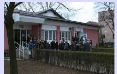
Health Care Station Nikola Tesla