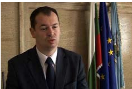
Miloš Simonović, Mayor of Niš

of the national teams was agreed at this meeting. Their task would be to develop project activities.