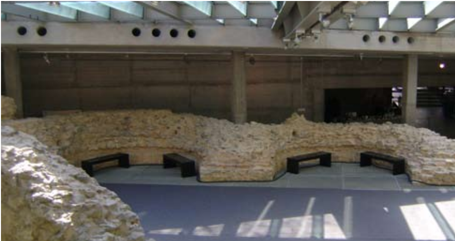
Christian remains from the Roman years - UNESCO World Heritage Site

Niš City delegation visited Hungarian city Pecs which has been designated as European Capital of Culture for 2010 together with the Essen (Germany) and Istanbul (Turkey).