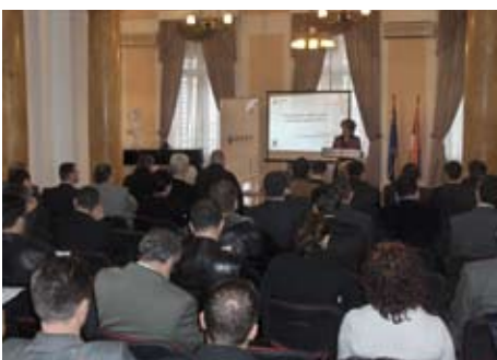
OLED presentation at City Hall

The presentation was dedicated to the achieved results and further work plans. The representatives of MEGA and LEDIB programme also spoke about cooperation with the Office for Local Economic Development.