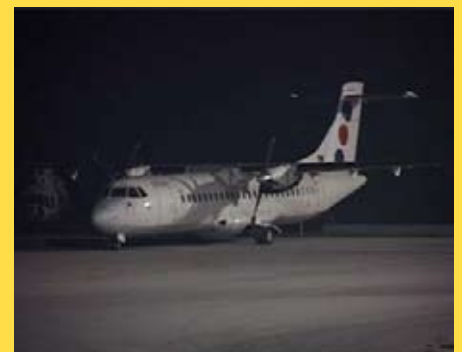
JAT airplane on airport Constantine Great