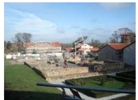
Archeological park Carnuntum

Niš has its role in this network since one of the Carnuntum Emperors was the Constantine the Great. The project envisages organizing the common artistic events for the forthcoming 1700th anniversary of Christianity recognition within the international