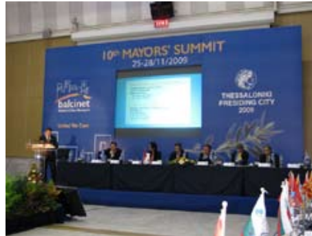
10th Balcinet Summit Of Mayors

BALCINET, the Network of major Balkan Cities, was founded in Thessaloniki in December 2001 aiming at the development of inter-Balkan inter-municipal co-operation. The topics of the 10th summit were economic recession, digital municipal services for the citizen and crime and drugs referring to daily life threats, the state responsibilities and