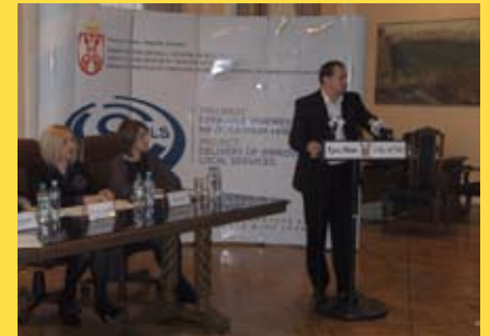
Niš City Mayor Miloš Simonović

Regional meeting between the representatives of RS Ministry of Health, local self governments, institutes for public health and Municipal Health Care Centers in 48 cities and municipalities in the South of Serbia was held at Niš City Hall.