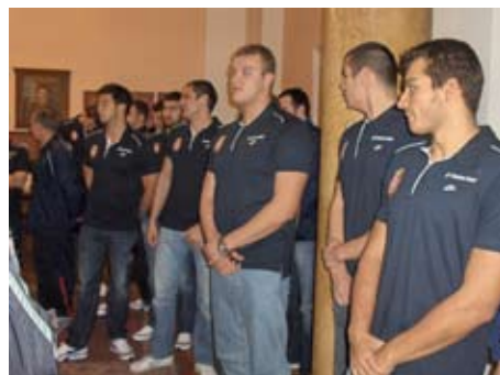
Serbina National Water Polo team