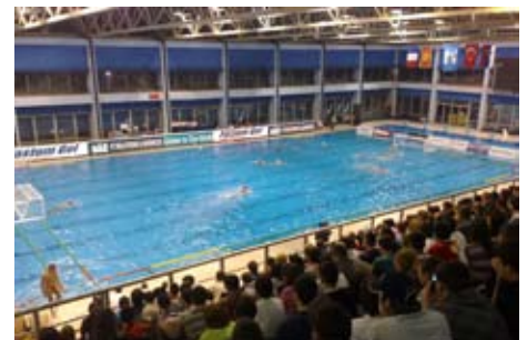
Čair Swimming Pool