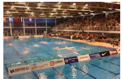
Serbian national water polo team started new season at the reconstructed pool at Čair