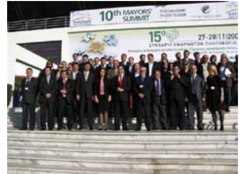
Mayors of major Balkan Cities

The basic objective of the BALCINET network is strengthening the cooperation between Balkan cities and developing economic and cultural bonds between local self-governments from this part of Europe. This kind of cooperation enables the peaceful co-existence between states and nations on