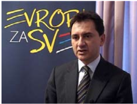
RS Government Vice-president Božidar Djelić at the presentation of the project EUROPE FOR ALL in Niš

she did something extraordinary for their community. The call for application submission is opened until November 25, 2009. Potential