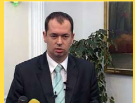
Niš City Mayor - JAT flies again from the airport Constantine Great