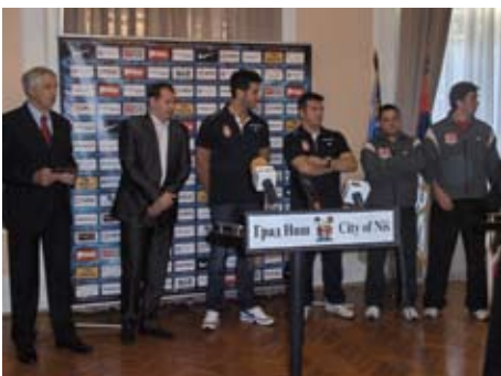
Reception at Niš City Hall