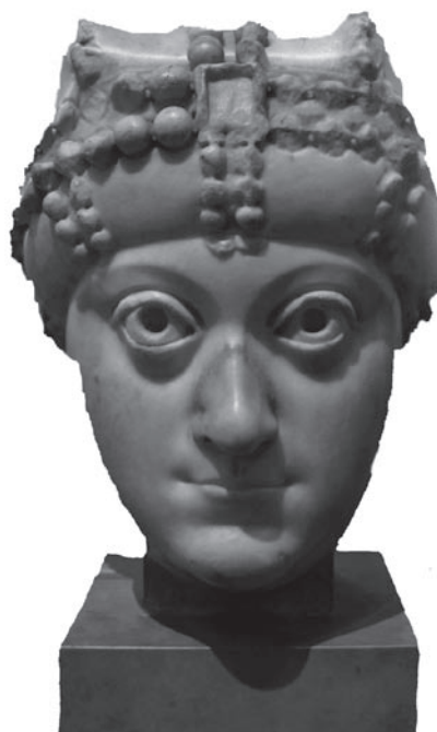
Fig. 4 Empress Ariadne or Amalasunta, Louvre.

Сл. 3 Марија Регина, Санта Марија Антиква (детал).