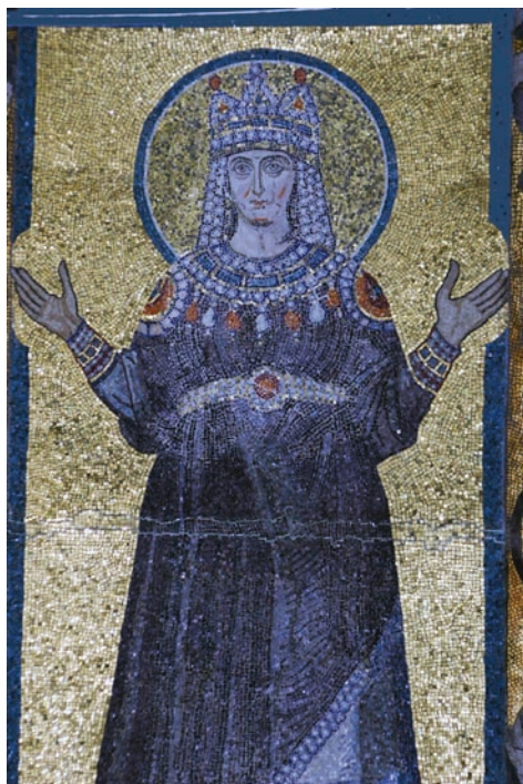
Fig. 10 Maria Regina from the oratory of John VII in St. Peter's basilica, San Marco, Florence (detail).

Сл. 10 Марија Регина из ораторијума Јована VII у базилици Светог Петра, Сан Марко, Фиренца, (деталј).