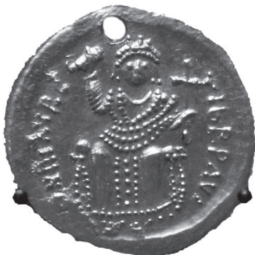
Fig. 2 Gold consular solidus of Emperor Maurice Tiberius (582-602).

Сл. 2 Златан конзуларни солид императора Марициа Тиберијуса (582-602).