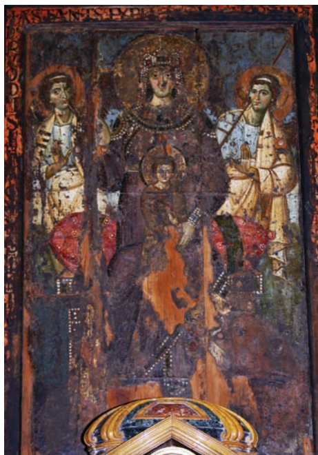
Fig. 5 The icon “Madonna della Clemenza”, Santa Maria in Trastevere, Rome.

Сл. 5 Икона „Madonna della Clemenza”, Санта Марија у Трастевере, Рим.