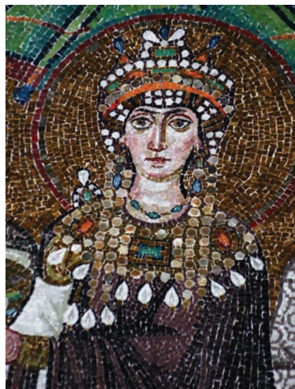
Fig. 8 Empress Theodora, San Vitale, Ravenna.

Сл. 7 Марија Регина, икона из Санта Марије у Траставере, (деталј).