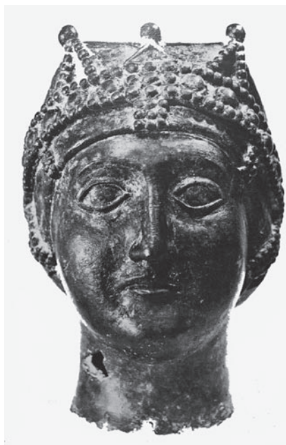
Fig. 6 Empress Euphemia (?), Niš.

Сл. 5 Икона „Madonna della Clemenza”, Санта Марија у Трастевере, Рим.