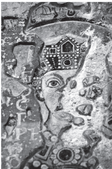
Fig. 3 Maria Regina, Santa Maria Antiqua (detail).

Сл. 3 Марија Регина, Санта Марија Антиква (детал).