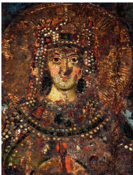
Fig. 7 Maria Regina, icon from Santa Maria in Trastevere (detail).

Сл. 7 Марија Регина, икона из Санта Марије у Траставере, (деталј).