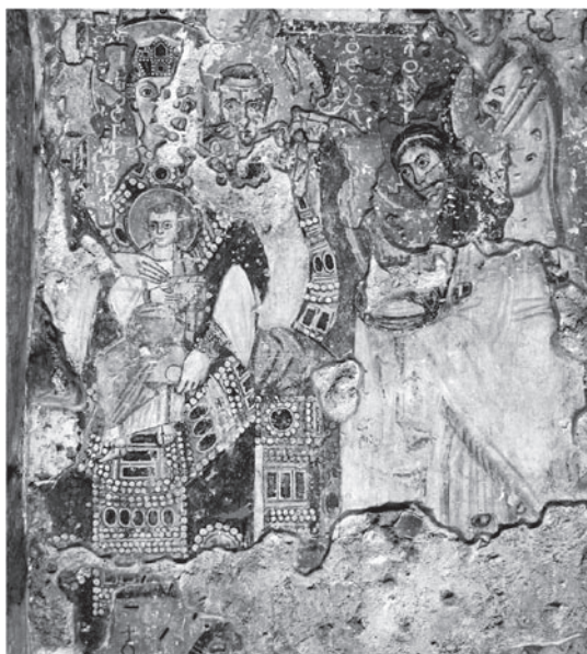
Fig. 1 Maria Regina, palimpsest wall, Santa Maria Antiqua, Rome.

The earliest survived examples of a fully developed iconographic type of Maria Regina can be found on a palimpsest wall of the Santa Maria Antiqua church on the Roman Forum, the acheiropoietos icon in Santa Maria in Trastevere and the orant Virgin in the Oratory of John VII (705-707) in the Old St. Peter's cathedral. In all three instances the Virgin is represented as Queen, which is conveyed through her vestments that reproduce, down to the smallest detail, the official attire of a Byzantine empress: the dark purple dalmatica , the lavishly ornate maniakion , the bright crimson shoes, and most of all the crown of the stephanos type very close in its forms with and, thus, equal to the rank of the emperor's stemma .