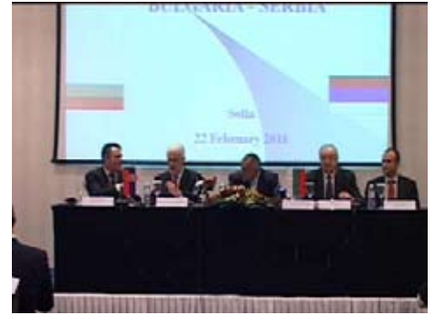
Business forum in Sofia Serbia - Bulgaria

Official delegation was followed by the business delegation comprised of the businessmen from Niš with the objective to find the partners in Bulgaria and to offer their product to Bulgarian markets.