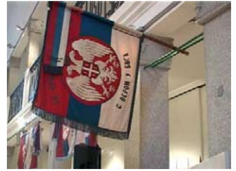
Serbian flags from World War I

The exhibition opening in Niš was attended by RS Government Vice President and Minister of Internal Affairs Ivica Dačić, representatives of diplomatic missions in Serbia and high city officials. Vice president Dačić in his address to the present guests stressed the determination of Serbian government to preserve Serbian state tradition and the tradition