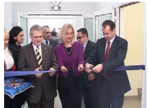
Opening of Fresenius Medical Care Special Hospital for Dialysis

Investment of German company Fresenius Medical Care is a proof that the City of Niš has good cooperation with foreign investors, but as well as that it is an important health care center with top experts. First dialysis treatment in Niš was done 40 years ago.