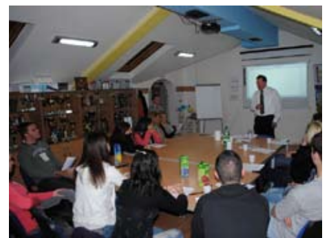
Presentation by colleagues from Denmark