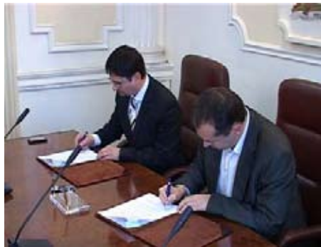
Signing the contract