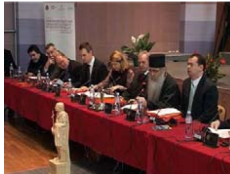
Niš Eparchy Saint Sava's Hall