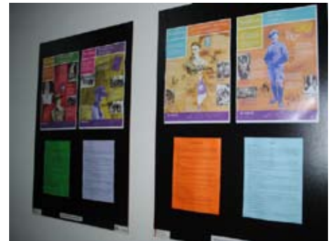
Information panels prepared by project participants