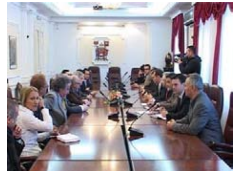
Niš City Council Session