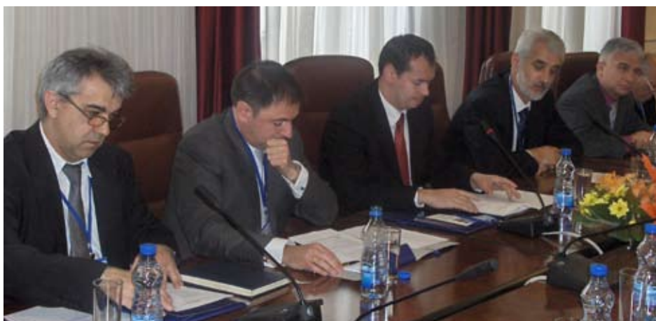
Round Table "Directions and Modalities of Nis City International Cooperation in the Domain of Science and Education"

The most important event in completing this initiative was the Round Table "Directions and Modalities of Nis City International Cooperation in the Domain of Science and Education" held at Niš City Hall. The main aim of this Round Table was a retrospective of previous experiences, potentials, problems, needs and perspectives of