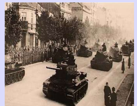
The exhibition of unique photographs from the personal archives belonging to Russian general Zhdanov

On this occasion, the exhibition of unique photographs from the personal archives belonging to Russian general Zhdanov was presented at the Niš Gallery of Contemporary Art Srbija.