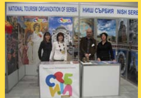
Niš Tourism Organisation

Niš Tourism Organisation participated at the VII International Tourist Fair in Veliko Trnovo in Bulgaria held from April 14 to April 17 2010 under the patronage of Bulgarian Ministry for Economy, Energy and Tourism and Municipality of Veliko Trnovo.