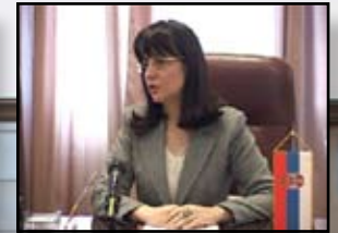
4 COOPERATION BETWEEN CITY OF NIŠ AND RS MINISTRY OF JUSTICE