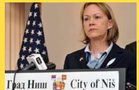
U.S. Ambassador in Serbia Mary Warlick

Niš City Mayor Miloš Simonović said that the City of Niš had established close cooperation with the U.S. Embassy in Belgrade and that the proof of that cooperation could be best seen through recent donations to Niš City institutions - the generator for Niš Clinical Center Urgent Medical Response Unit and equipment for Niš City National library.