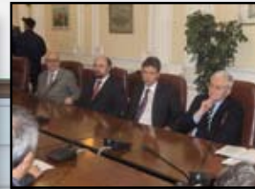
3 VIENNA CRISIS MANAGEMENT UNIT DELEGATION VISTED NIŠ COOPERATION