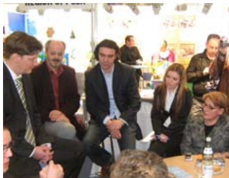
The Fair of Tourism and Craftsmanship held in Mainz

Niš City delegation also had the meetings at the Rhineland Palatinate Ministry of Economy, Traffic and Tourism. The contacts were established with the Koblenz Chamber of Craftsmen and the joint implementation of the common projects could be expected in the future.