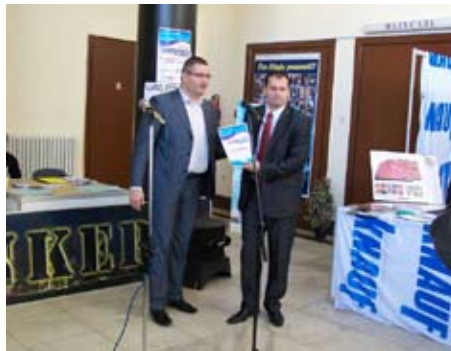
The First Real Estate and Investment Fair

Three new locations for the construction of the residential units within social housing was presented at the fair as well. City of Niš also