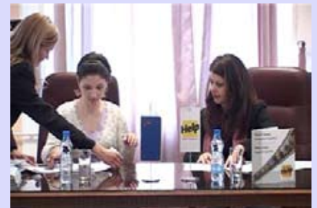
Contracts For New Start-Up Businesses

The organisation HELP has signed 10 new contracts within the realisation of grant - credit component of the project Support to Local Economic Sustainable Development in South Serbia" which which has been being implemented in Niš, Vranje, Bujanovac, Gadžin Han, Pirot and Preševo since November 2008.