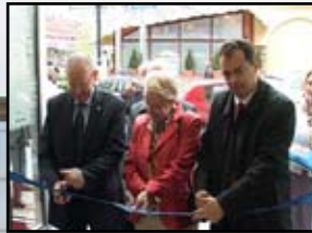
2 JOB CENTER NIŠ