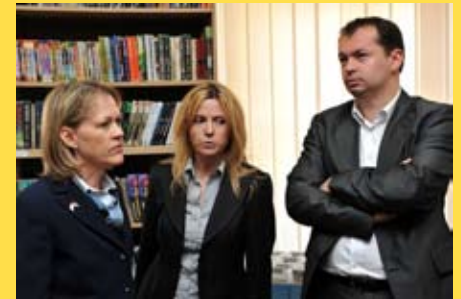
U.S. Embassy Donates To Public Library Stevan Sremac Niš