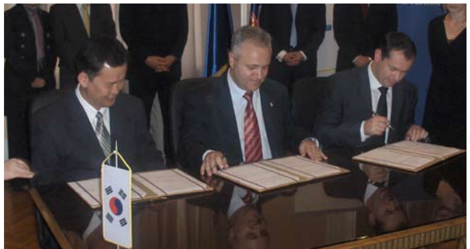
The Memorandum of Understanding between RS Ministry of Economy and Regional Development, City of Niš and South Korean company Yura Corporation was signed at Niš City Hall