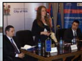
4 OPEN DAYS IN NIS