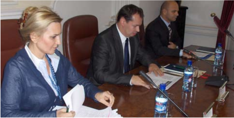
First Regional Development Council Constitution Session

The constitutional session of the first Regional Development Council in Serbia was held in Niš.