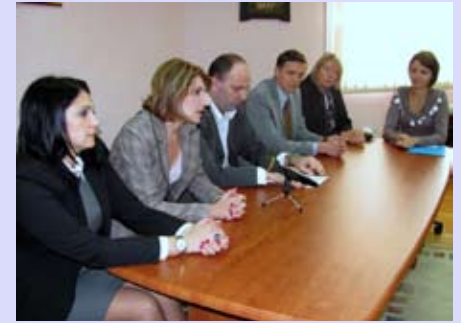
Internationaler Bund Delegation in Nis

City of Nis and City Municipality Palilula initiated the cooperation with German Organization Internationaler Bund which has been providing services to people with disabilities for more than 30 years.