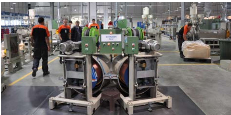
New Production Facility

South Korean Company Yura opened new factory Shin Won for the production of car cables. 500 people will be employed at this new factory.