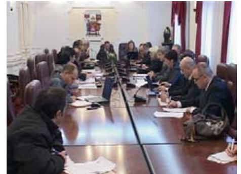
Niš City Council Session

bases as potential sites for Brownfield investments. The national Defense System Reform Strategy passed in 2004 recognized this issue and defined the legal framework which would allow for auctioning off surplus military property. Local governments were given preemptive rights. The Master Plan adopted in June 2006 established the procedure for the conversion of property for commercial purposes and how the military could utilize the resources it receives as compensation. The City of Niš with its projects of converting military property for civil uses is the example of good practice in the cooperation with Serbian government.