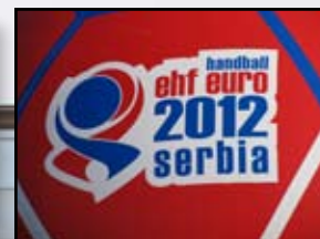
7 MEN'S EHF EURO 2012 COUNTDOWN CLOCK STARTED TICKING