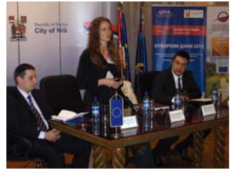
Open Days Local Event

The experience in the area of public private partnerships were presented by the representatives Nis City, Nis University, Regional Development Association South, guests from regions and regional agencies in Serbia and abroad, as well as representatives of public and private sectors.