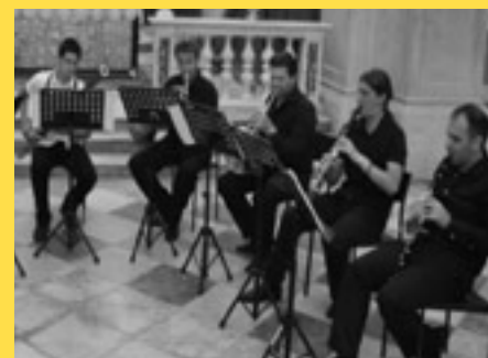
NIMUS 2011 – JOIN US