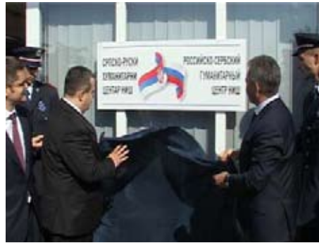
Dacic and Shoigu Unveiling Plaque

Dacic and Shoigu visited the warehouse and the premises intended for the centre headquarters where the plaque inscribed with the name of the centre was symbolically unveiled. Russian Ministry for Emergency Situations provided 35 tons of supplies such as tents, blankets and power generators intended for the joint centre for the prevention and elimination of consequences of emergency situations.