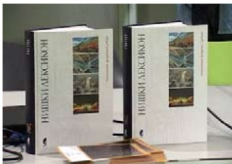
Nis City Lexicon