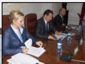
3 SOUTH EAST SERBIA REGIONAL DEVELOPMENT COUNCIL