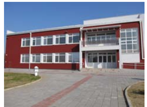
New primary school Ivo Andric

Newly built premises of Ivo Andric Primary School together with gym cover the area of 3350m 2 . 500 new pupils will find their classrooms in these newly built premises.