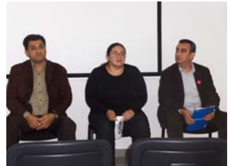
Human Rights Debate