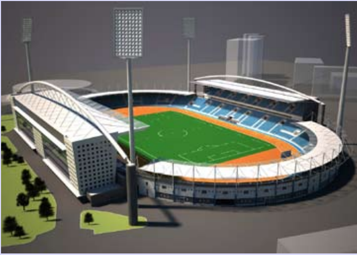
Future Čair Stadium Design