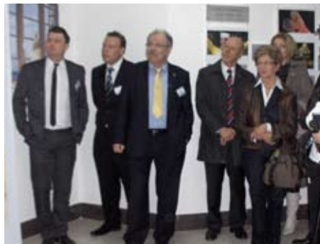
Danes in Niš