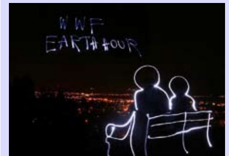
Lights Out for Earth Hour

Green NGOs from Niš - Space, Green Key, Zoo Planet and Niš City Green Network promoted the Earth Hour Initiative and organised the Sing for Planet Programme which gathered the choirs, bands and volunteers from the city at the square in front of Niš National Theatre on Saturday evening.