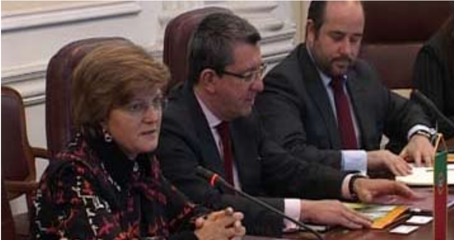
Portuguese Minister of Environment and Spatial Dulce Passaro

The delegation of Portuguese Ministry of Environment and Spatial Planning led by the Minister Dulce Passaro came to official visit to Serbia.