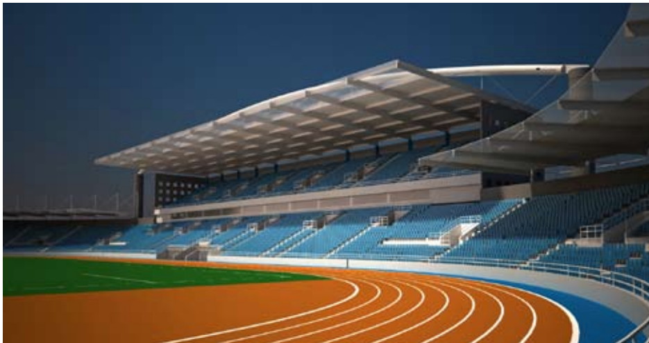
Future Čair Stadium Design – East Stands

the East Side Stand wrecks to the representative of Radnicki Fan Club as a sign of initiation of works. He added that he expected Radnički to enter Super League with the matches at new stadium by 2013.