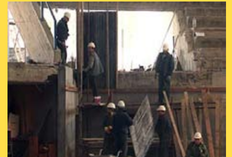
Sports Arena Čair Reconstruction

Niš Stadium Čair was built in 1963. No investment has been made for last 30 years. After the reconstruction in line with FIFA standards Niš Stadium will have a completely new look.