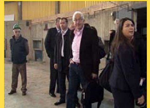
EHF delegation inspecting the Arena Čair reconstruction progress