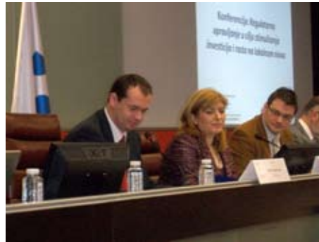
IFC Closing Conference

Niš City Regulatory Reform team adopted 701 recommendations for simplification of the total 318 administrative procedures (96% of total recorded procedures). The respective administration units adopted 47 legal acts which introduced the recommendations