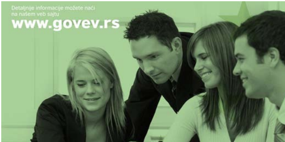
Speak European - practical training for public officers

City of Niš has been preparing itself to respond to all tasks which will be awaiting the city once Serbian application for EU membership is accepted.