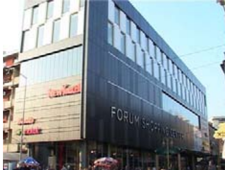
New shopping mall "Forum"

The owner of this shopping mall is "Fashion Company", one of the