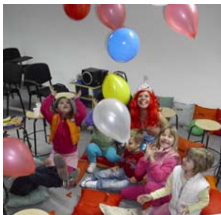
Little Mermaid at the workshop for children