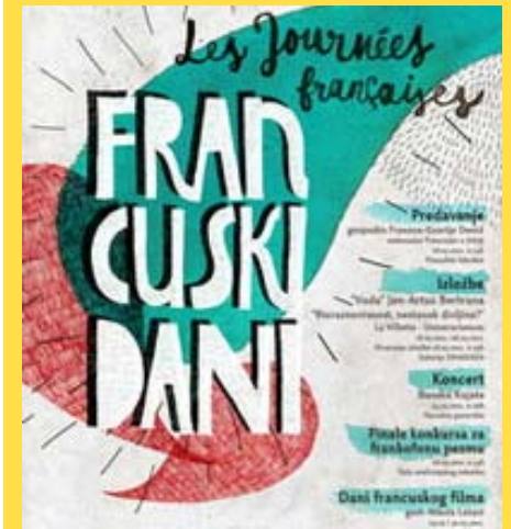
French Days in Niš

French Institute in Niš, in cooperation with the City of Niš and local institutions, organized manifestation French Days, for eighth time.