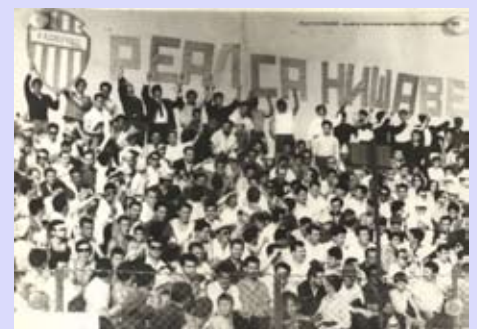
FC Radnicki fans at the stadium stands in 1963

area where the accreditations could be obtained. The media block has its own toilet facilities. Entrance area leads to the press conference room which is connected to mix zone for the interviews with the players before and after the game. The press conference room can used independently even when there are no matches. Journalists will have the room for working and sending their reports facilitated by contemporary communication lines. The photographers will have special storage room for their cameras and other equipment. The project designs the space for OB truck and TV broadcasting and editing. The box for managing floodlights, speakers, and the boxes for TV commentators will be located in this part of stadium. Media lounge will have mini bar and it can be used as journalists' club. Media sector is connected with stadium management sector.