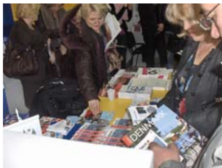
About Denmark and Aarhus