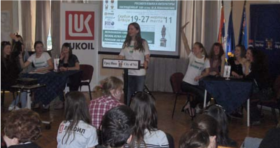
Competition about the life and work of Mikhail Vasilyevich Lomonosov

International forum of Russian language and literature was held at Niš City Hall on the occasion of celebrating 300 years since Mikhail Vasilyevich Lomonosov was born.