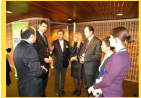
Serbian delegation in CoE congress of local and regional authorities

20th Session of the Congress of Local and Regional Authorities of the Council of Europe was held in Strasbourg.