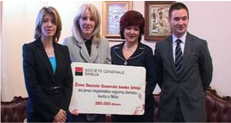
Société Générale donates to Safe House

Société Générale Bank donated 250.000 dinars to the Safe House.