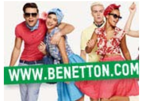
Benetton in Niš

Benetton will keep and adapt the existing building within Nitex complex that satisfy the necessary requirements while the rest will be torn down. Completely new equipment will be installed both in old and new premises. The City of Niš will support Benetton within the jurisdiction of local authorities, assuming all responsibility for providing proper and expeditious administrative service and support