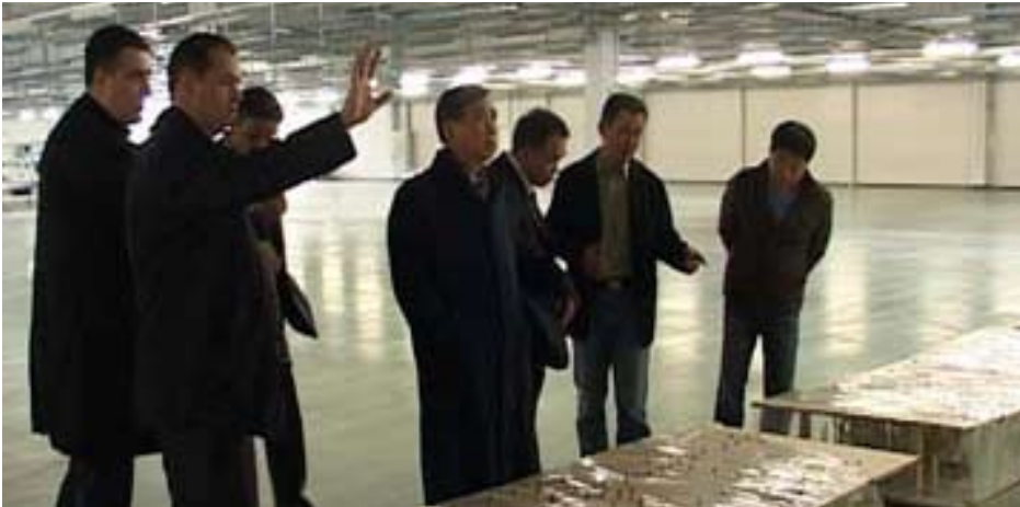
Korean Ambassador visitin newly constructed Yura factory in Donje Medjurovo