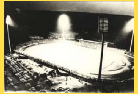
First match under flood lights

Niš Stadium Čair was built in 1963. No investment has been made for last 30 years. After the reconstruction in line with FIFA standards Niš Stadium will have a completely new look.