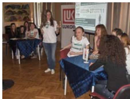
Competition about the life and work of Mikhail Vasilyevich Lomonosov

This project is realised with the support of Russian Federation Ministry of Foreign Affairs, Russian Federation Embassy in Serbia, Serbia Embassy in Moscow, Federal Agency for CIS Affairs, compatriots living abroad, and international humanitarian cooperation, City of Novi Sad and City of Nis. The project is sponsored by Aeroflot and Lukoil.