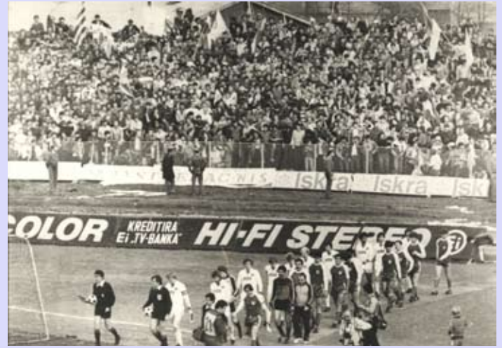
1982 UEFA Championship – Radnicki vs. Hamburger

Čair Stadium Reconstruction started with the preparation works on the East side Stands which had been out of function for previous 15 years. The main reconstruction conceptual design envisages all-seater stadium with 6966 seats on the East side stands, 9037 seats on South and North side stands and 2154 seats on West side stands. Reconstructed stadium will have the capacity of 18 151, with additional 120 seats for VIPs and 50 seats for media.