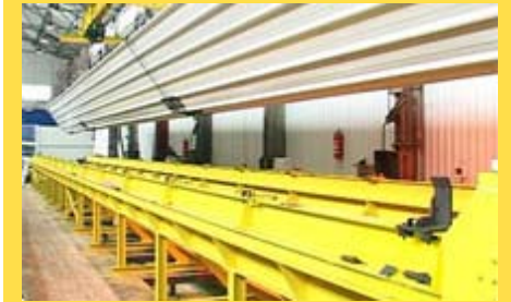
Baticoc Company Factory in Niš

French company Batiqoc together with its business partners Batiroc and Axe Metal opened the production facilities in the hall of the company MIN Special Vehicles.