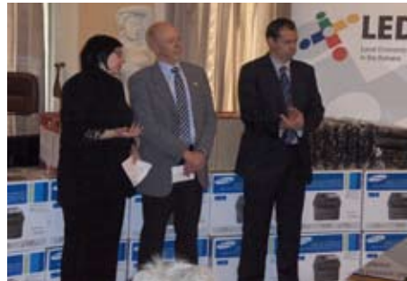
Computers and software for secondary schools

The contract on the donation of the computer equipment was signed