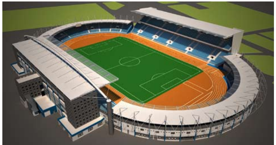
Future Čair Stadium Design

Niš Stadium Reconstruction officially started on March 30, 2011 by tearing down the old stands on the East side of the stadium.