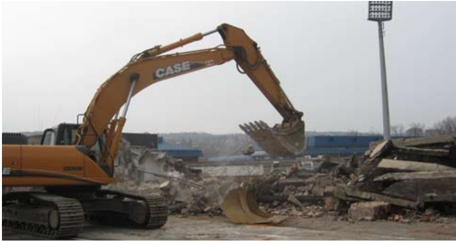
Tearing down East side stands

in this project. I expect that, when I come back to Niš in 270 days, we will open the Stadium”, said Minister Dulić.