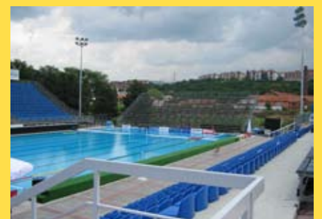
Swimming pool complex at Sports Center Čair

Niš City will get contemporary sport complex with reconstructed Stadium and Arena Čair and constructed open air swimming pool.