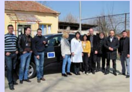
New terrain vehicle for mobile teams

Niš City Municipality Palilula received new terrain vehicle as the part of EXCHANGE 3 Project for raising municipality capacities for improving the life quality for socially vulnerable groups of citizens.